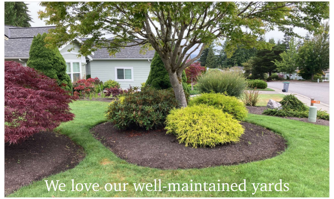
We love our well-maintained yards

Website Please visit tlva.net where you will find answers to important questions, calendar, news, and happenings around town.