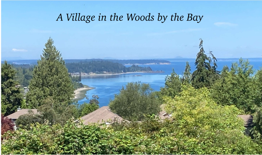
A Village in the Woods by the Bay